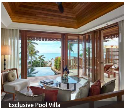
Exclusive Pool Villa